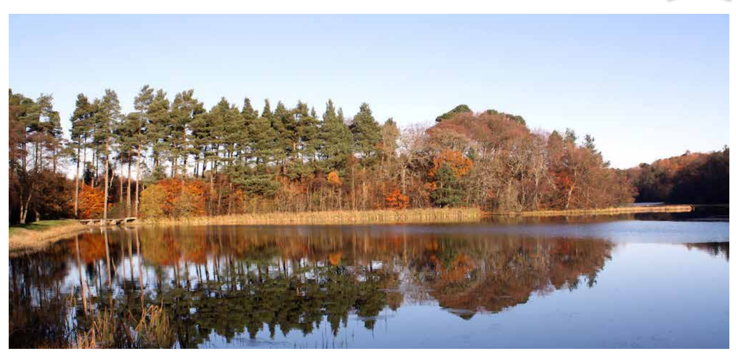
Rothley Lake