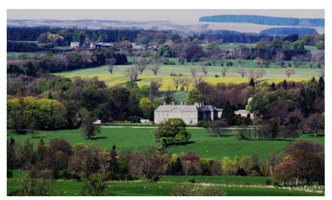
Aerial view of Wallington