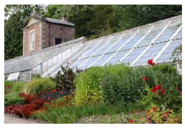
Owl House and conservatory

Brown has been credited with designing the three-storey Owl House (listed Grade II). This is a brick gazebo with an external staircase, situated on the north side of the walled garden behind a 20th century conservatory (listed Grade II). It gets its name from the stone owl that sits on top, representing the Calverley family crest. Owl House was probably built around 1766, when Sir Walter was remodelling the estate. Although there is no plan, this building does look similar to the one Brown is known to have designed at Talacre, Wales, although that was in stone.